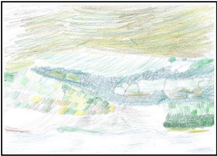
Picture drawn by Alexie from a photograph taken whilst out on activities

Teamwork is all about teamwork with yoooooooo, yeah!