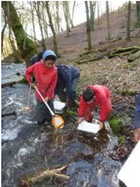
St Francis de Sales Junior School on stream study in St Mary's Vale.