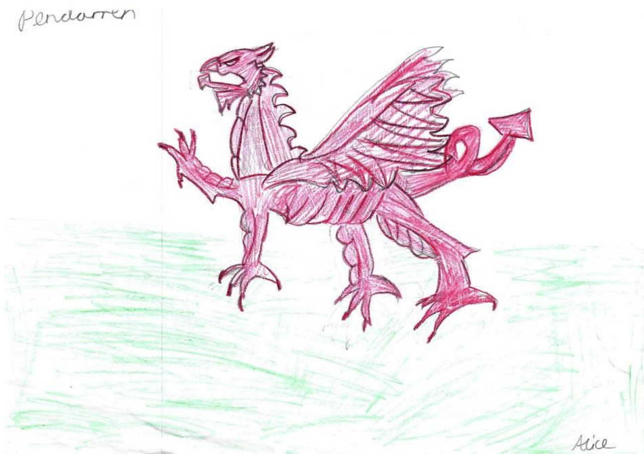
Drawing by Alice