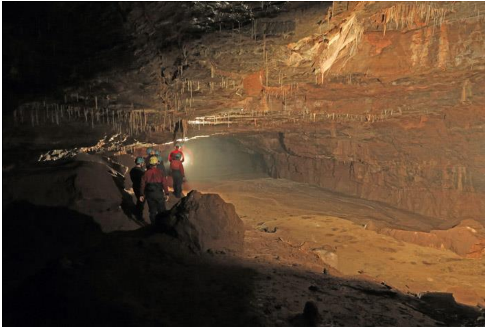
This was also taken in Little Neath River Cave and shows stalactite formations.