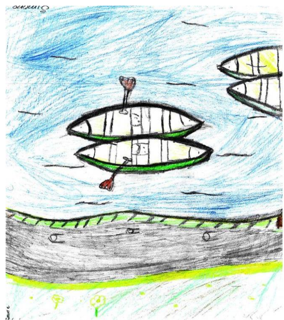
Drawing by Simone

The pupils had an amazing week where they were engaged, challenged and built up resilience and teamwork skills. Allowing them to take risks on activities was invaluable.